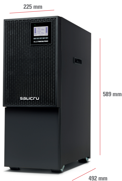
SLC 4000÷10000 TWIN PRO3